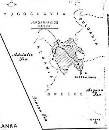
LOCATION MAP SCALE IN KILOMETERS

BOŠROV MOST SPILJE GLOBOČICA Projects outside Basin but included in Study.